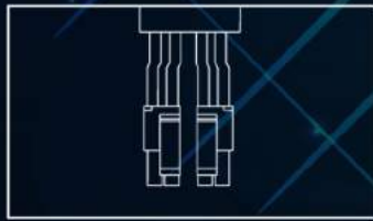
1 x 8(4+4)-pin ATX12V / EPS12V