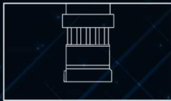
9 x SATA