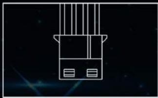
6 x Molex