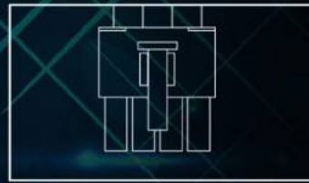
1 x 8-pin EPS12V