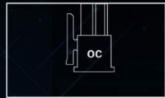
1 x OC Link