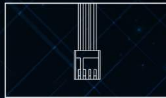
1 x Floppy